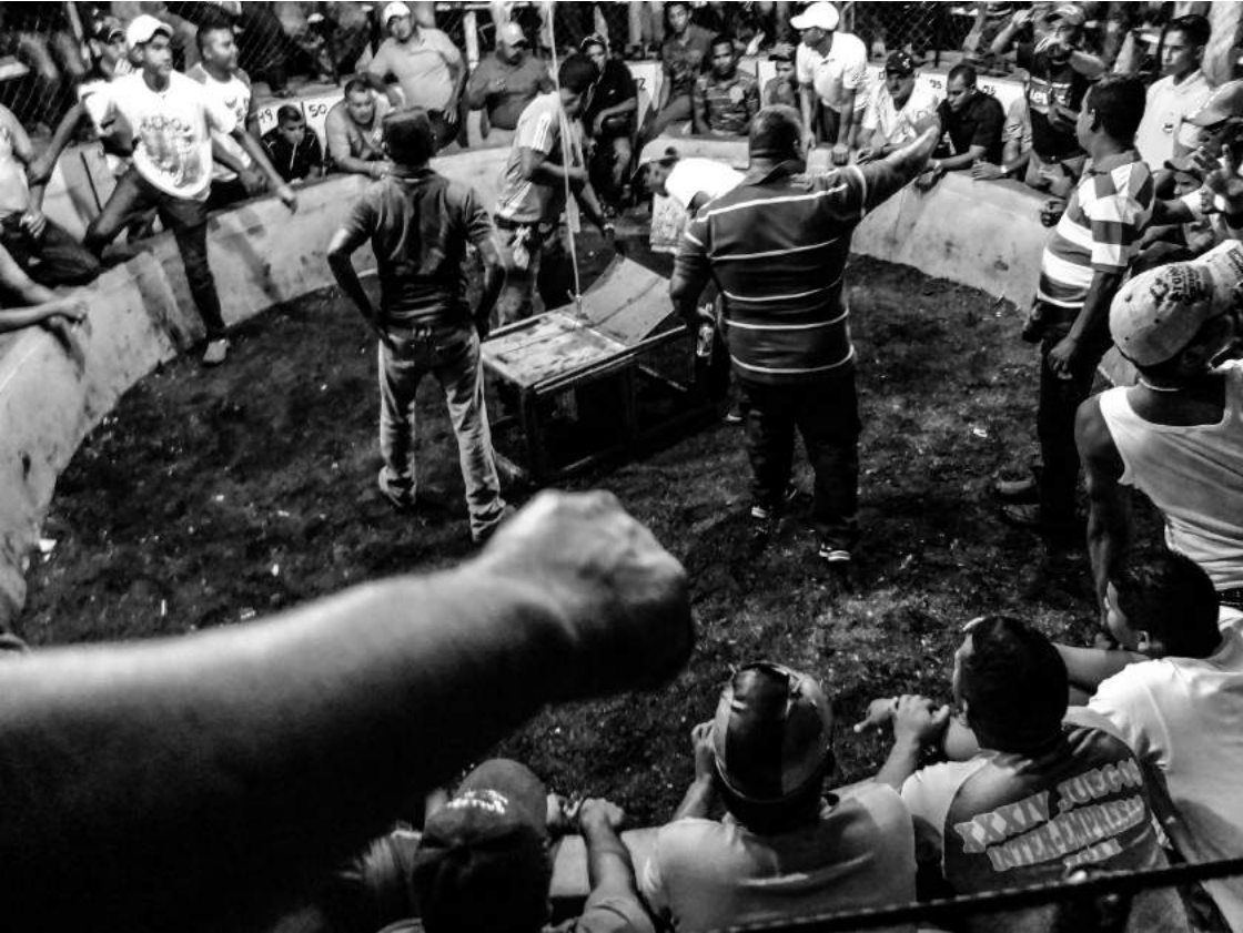
Collective celebration of victory.