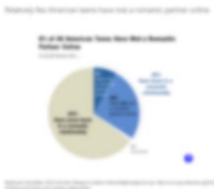
Figure 7: Screenshot of part of a text in 2017 preparation material, showing pie chart and its colors (blurred to prevent copyright infringement).