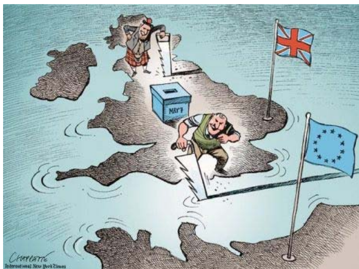
Figure 5: "Brexit" by Patrick Chappatte, from New York Times International. Reproduced in this article with kind permission from the artist. © Chappatte, The New York Times www.chappatte.com

The image in Figure 5 is part of a page containing four quotations about