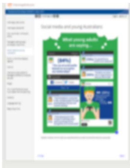
Figure 6: Infographics from the 2017 10 th grade preparation material (blurred to prevent copyright infringement).