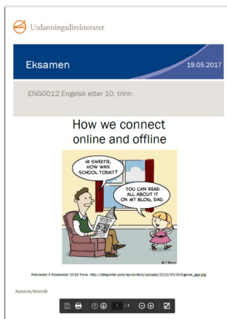
Figure 8: Front page of the 2017 10 th - grade examination, featuring "Generation Gap" by Bill Porter © 2007; image reproduced with permission.

Regarding the actual tasks, all five examinations analyzed here are structured in the same way, with two parts. Part 1 contains two tasks, both of which must be